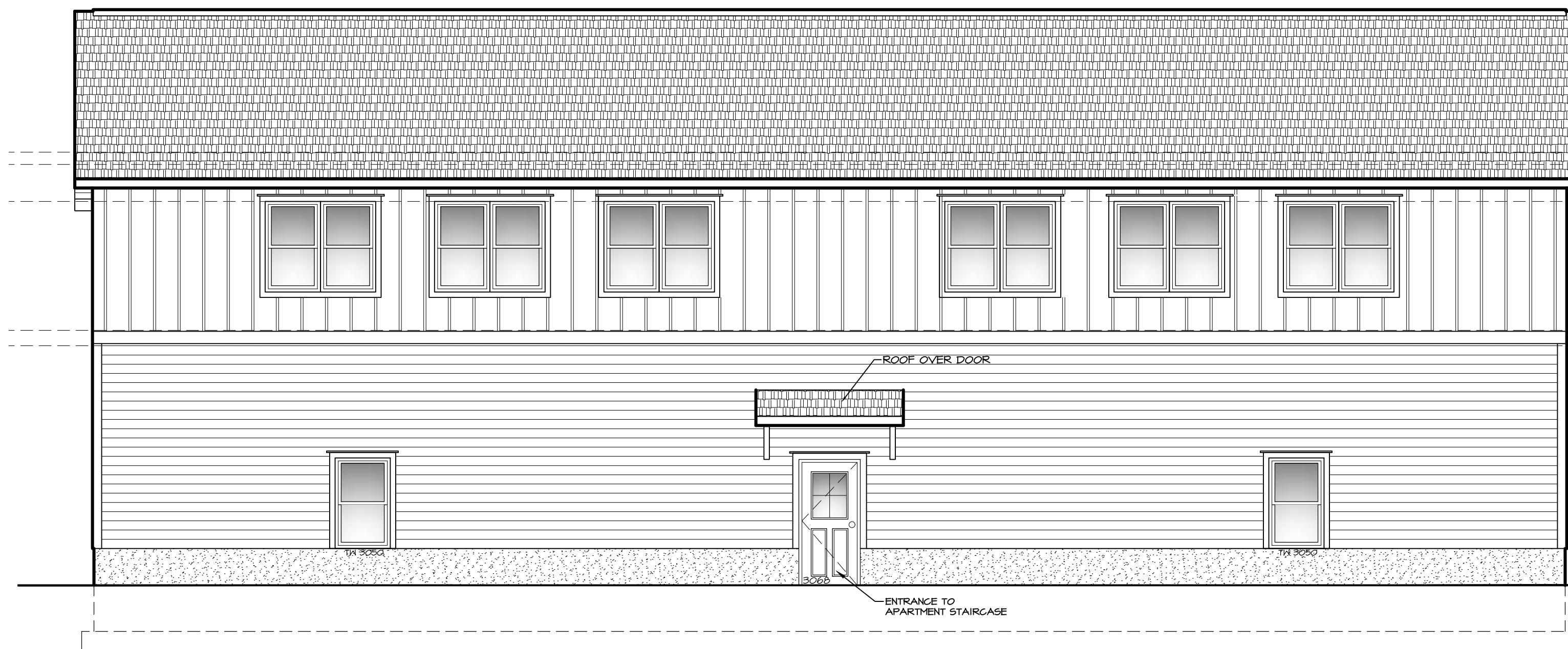
2 REAR ELEVATION EAST FACING