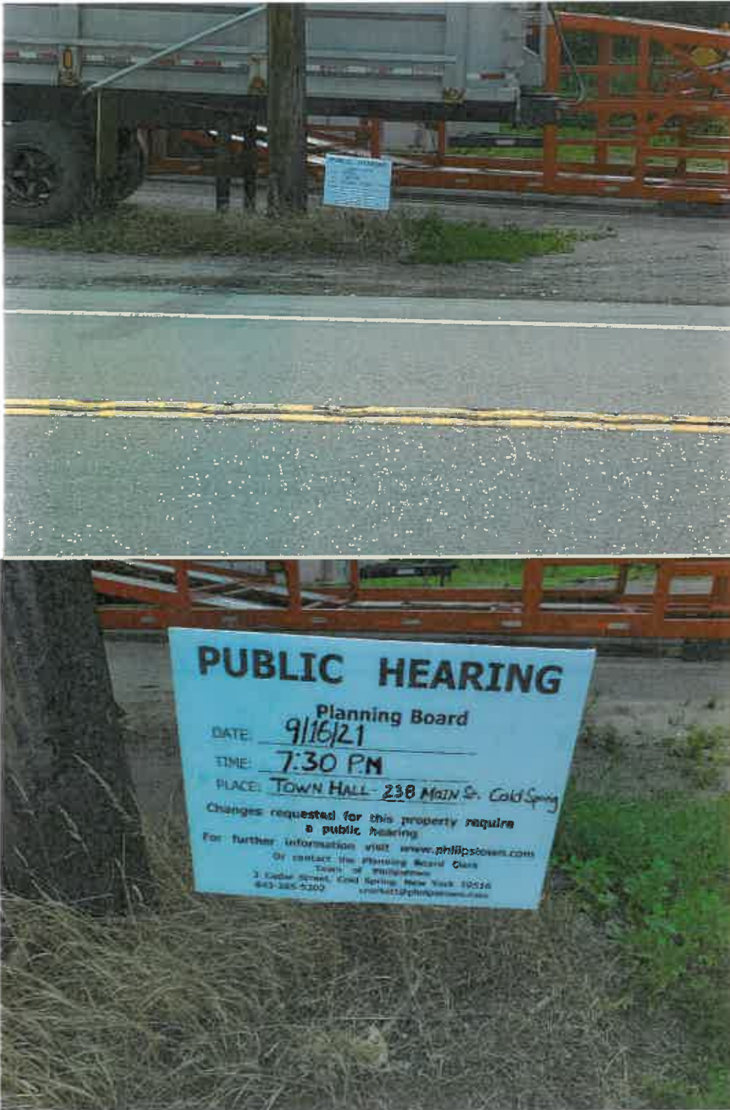
Photographs (2) of Public Notice posted at Riverview Industries Site on Route 9 in Cold Spring Attached to Affidavit of Glennon J. Watson, dated October 7, 2021.